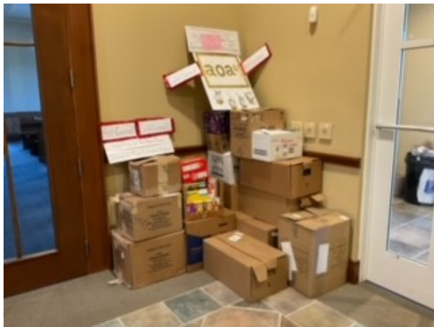
LET THERE BE CEREAL! GOOD JOB COUNTRYSIDE!

It bears repeating.... It is not Founders Hall Founder’s Hall Founders’ Hall The Founder’s Hall The Founders’ Hall